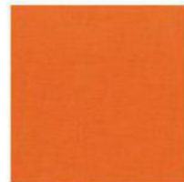
40171-7 Red Yellow (Orange) ½ yd