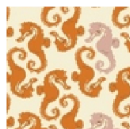
40941-15 Orange Seahorses 1 FQ