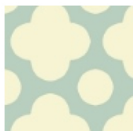
40939-7 Aqua Octopi ½ yd