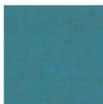
40171-31 Turquoise Copper (Turquoise) 1 FQ