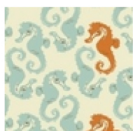
40941-7 Aqua Seahorses ½ yd