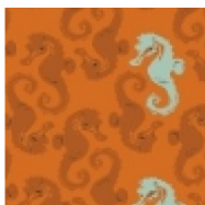
40941-8 Dk Orange Seahorses ½ yd