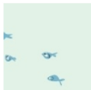
40942-7 Blue Fish ½ yd