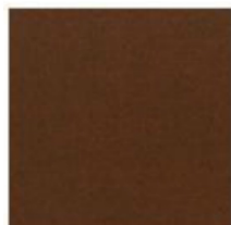
40171-27 Black Copper (Brown) 1 fat 1/8th